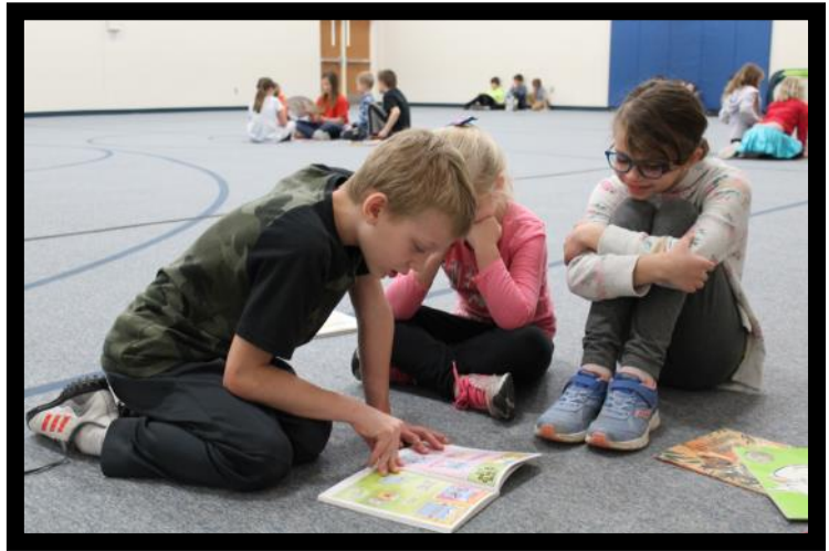
The children are enjoying their reading buddy groups.