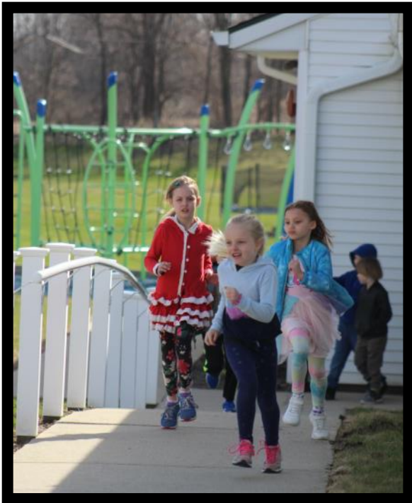
Mileage Club started after Spring break. Children are working hard to receive each toe token.