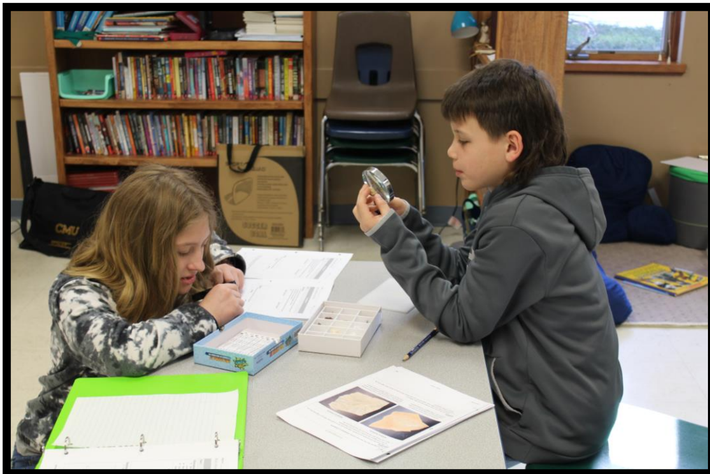
The sixth and seventh grade classroom is hard at work with their Science lesson.