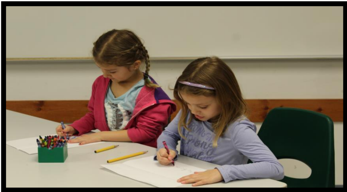
Children having fun creating masterpieces for Art class.