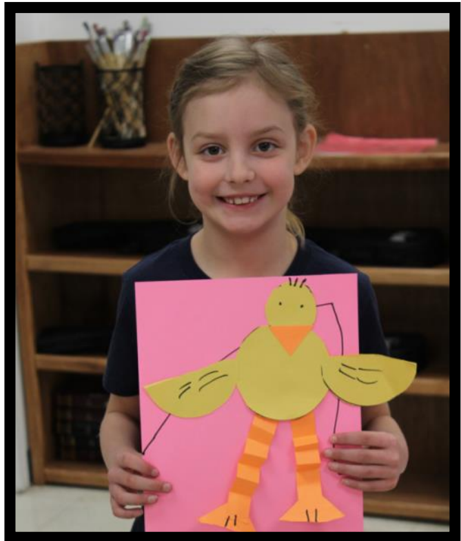
A student proudly displaying her art work.