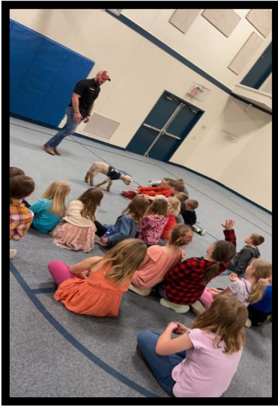
For Holy Week students were able to learn about lambs and pet one!