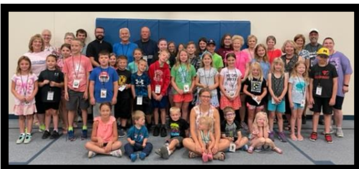
VBS group 2022