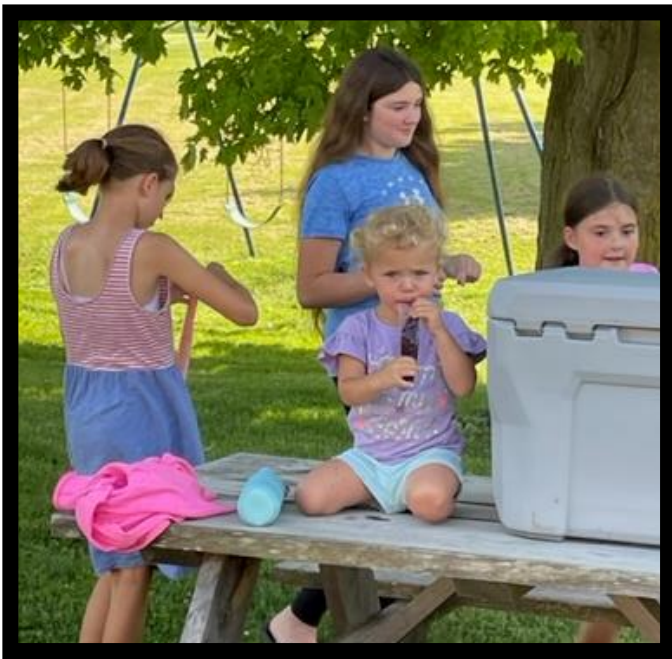
End of the year field day 2022 for day school students and families. Students here are enjoying the cool -down station with popsicles.