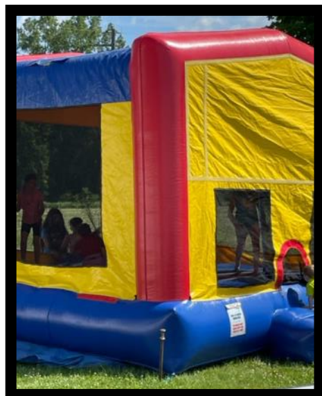
Children enjoying the bounce house at field day.