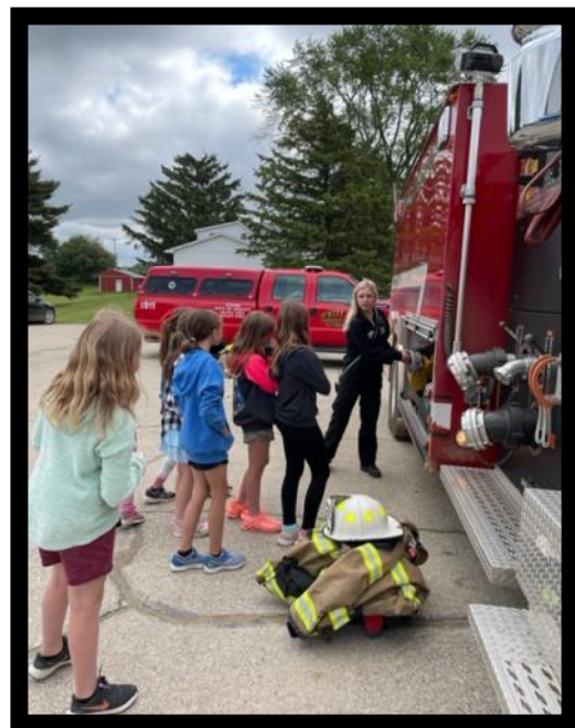
Students are learning what it takes to be a fire fighter and what all things you need when reporting to a fire.