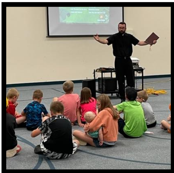
Pastor is going over what the children learned during the week at the close of VBS.