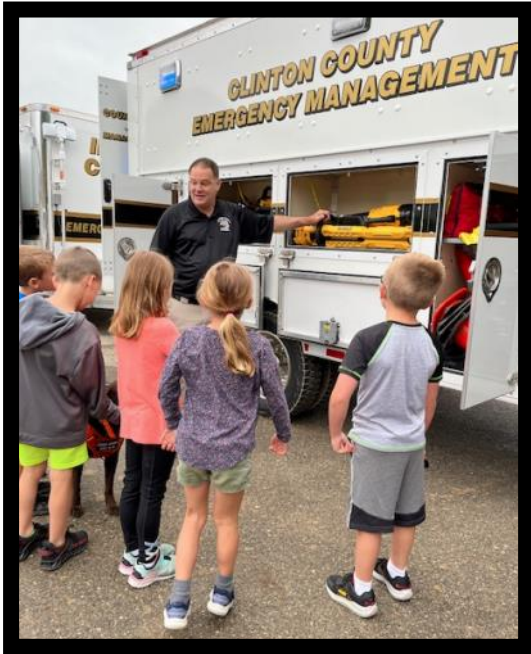
Students learning about the emergency workers at the touch-a-truck event that came to our school at the end of the year.