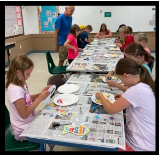
Children doing crafts at VBS. They are making fishers of men magnets with colored sand.