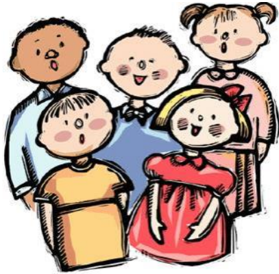
Kids Singing in Church

Kids singing in Church on Sunday, February 23 rd at 10:00 a.m.