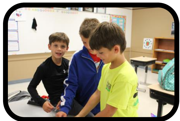
6th grade team work!